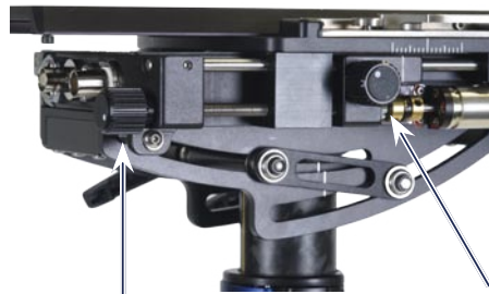
fore and aft adjustment knob

The stage is easy to adjust. The knob at the right rear controls fore and aft, and the two knobs on the side control side to side movement.