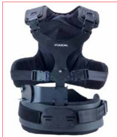
(ABOVE) Flyer-LE Vest.