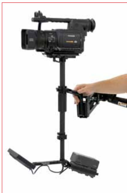
(ABOVE) The Flyer-LE with the Panasonic P2 camera complement each other perfectly.